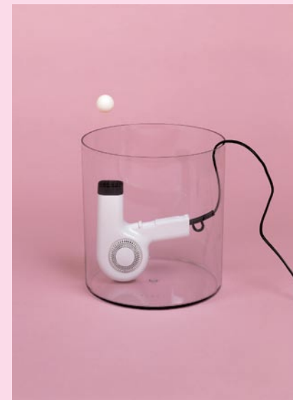
Damien Hirst "What Goes Up Must Come Down" 1994

He has used dead animals such as sharks and cows in his work.