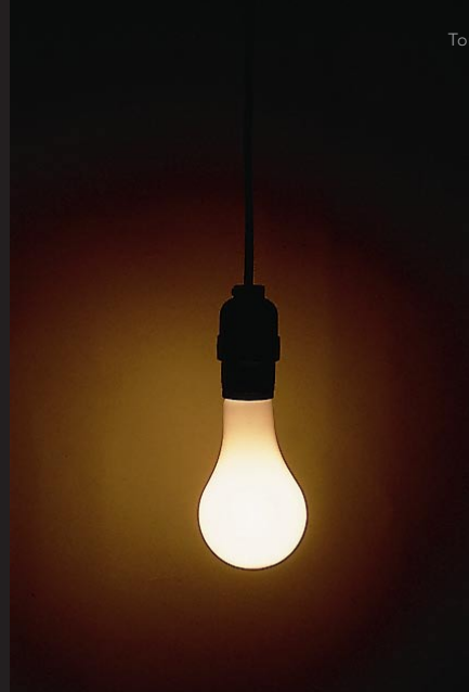
Tony Oursler "Talking Light" 1996

Tony Oursler is an American artist who uses film, projection and sound to create sculptures.