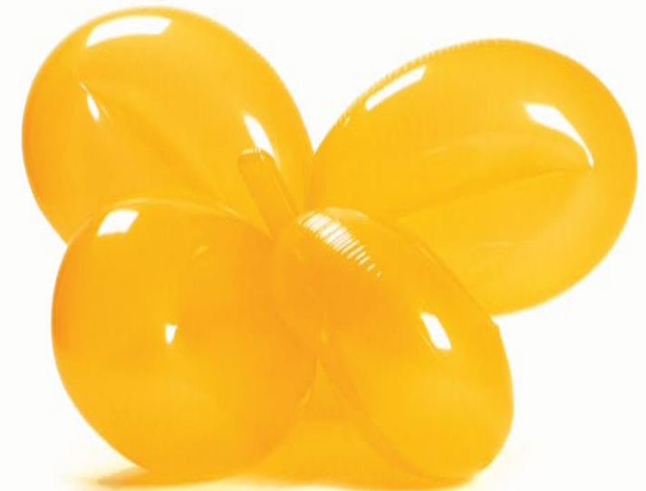
Jeff Koons "Inflatable Balloon Flower" (Yellow) 1997

Many of Jeff Koons' art works are sculptures of blow up balloons from dogs, rabbits to flowers. He says that the inflatable balloons represent the life and optimism of people as they are so much fun and childlike.