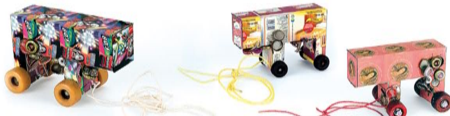
Francis Alj's "Ghetto Collector" 2003

Every day we throw away so much rubbish without thinking how it affects our environment. Can you be imaginative and think of any waste that you could turn into art?